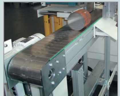
Hinge chain conveyors For long cut-off lengths, we recommend disposal grippers in connection with a chain conveyor and/or a roller conveyor with sorting positions.