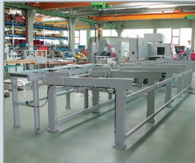
Bar loading magazine Automatic loading of round bars