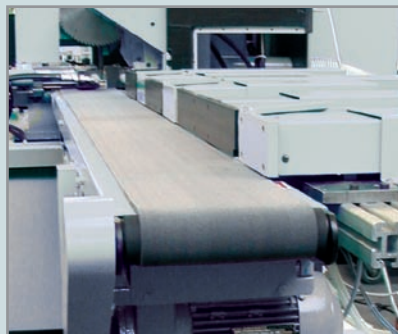
Disposal conveyor belt One or more disposal or buffer stations, depending on application and requirements. For example, transfer to brush de-burring stations, furnaces, robots etc., or to marking stations for marking or stamping the cut pieces.