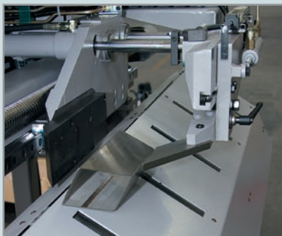
Tiltable roller conveyor Sorting of the cut-off and remnant pieces by means of a sorting device (mounted at the front and at the rear side of the machine) and ability to transfer to subsequent devices.