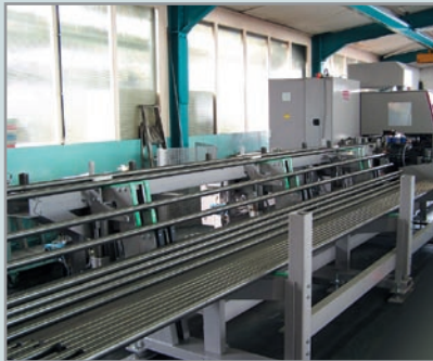
Bundle loading magazine Automatic loading of materials of different shape