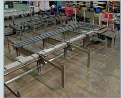
Flat loading magazine Automatic loading of different material profiles - the generalist